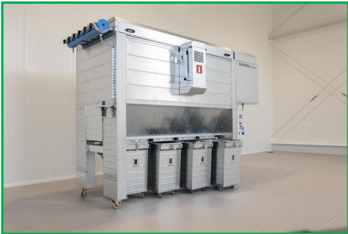
Example drawing of Vaco Max S 3000-3000+

Innovative technologies in the field of air purity and environmental protection in industrial sector have been the domain of NAWARA company since over 20 years. Independently, if it concerns dust extraction, transport, grinding, varnishing, air pollution from dust or construction of installations NAWARA company is the main leader and competent in many fields with customer, offering its customers high quality solutions in the field of dust extraction and environmental protection as well as managing with noise level and explosion hazards.