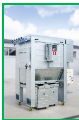
Vaco Max S1000